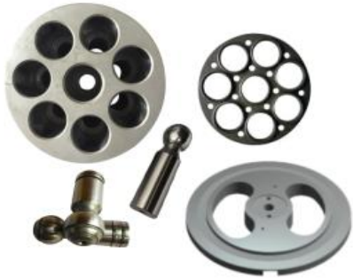
LZV30/120/LVWO60 SWING MOTOR LZV030/060/090/120/180/260/500 PUMP