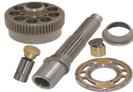
TM40VD TRAVEL MOTOR